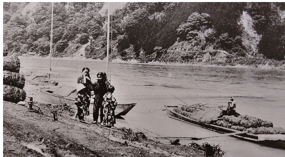
MOGAMI RIVER IN THE SHOWA ERA